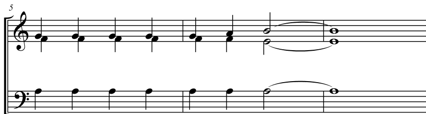
Fig. 16. Medieval West Georgian church song “Zhamta da tselta” (opening recitation)

The love of dissonant harmonies was, I believe, one of the main driving forces of the long lasting interest of George Harrison in Bulgarian traditional singing, famous for the secondal dissonant clashes, during the 1980s.